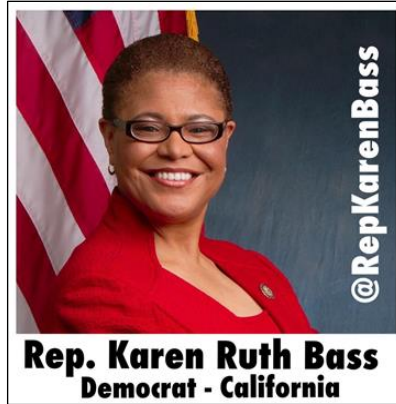
Left: Thornberry UK - Parliamentarian, urges the UK govt to restrain from signing Trade Deals with the Cameroon govt. Instead, they should join the US-Senate to pressure the regime of Cameroon to stop gross violation of human rights.