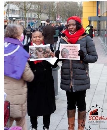
Left: SCEW e.V. with Global Takumbengs